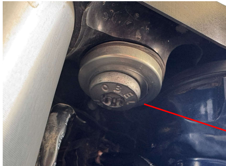
Handlebar- mount bolts